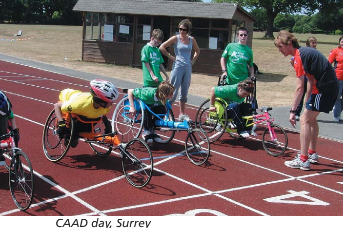
CAAD day, Surrey